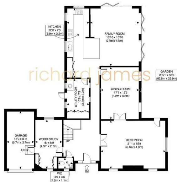
GROUND FLOOR GROSS INTERNAL FLOOR AREA WITH GARAGE 1753 SQ FT