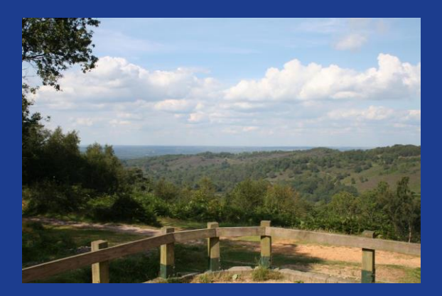
View from the Devils Punchbowl