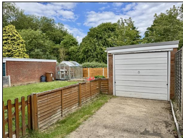
DETACHED BRICK GARAGE