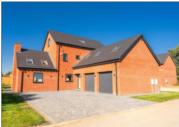
PHOTO FROM SIMILAR PROPERTY