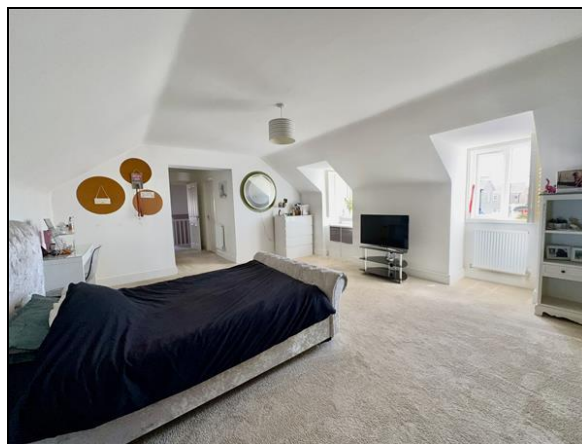
PRINCIPAL BEDROOM SUITE