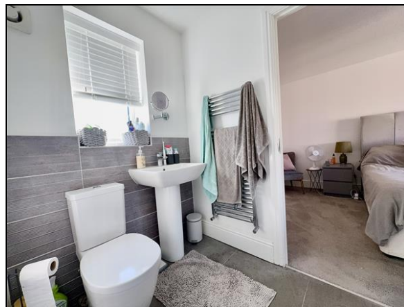
JACK AND JILL SHOWER ROOM

Mains gas, water, electric and drainage are connected and broadband speeds are available and can be accessed via the Ofcoms checker website. Central heating comprises radiators detailed above connected to the Logic Combi 35 boiler located in the garage. The property has the benefit of uPVC framed double glazing, falls within the jurisdiction of the North East Lincolnshire Council and is in Council Tax Band F. The tenure is Freehold - subject to solicitors verification. Viewing is strictly by appointment through the Agents on Grimsby 311000, a video walkthrough tour with commentary can be seen on Rightmove and our Martin Maslin website.