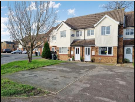
Further Front Aspect