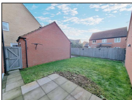
Further Garden Aspect