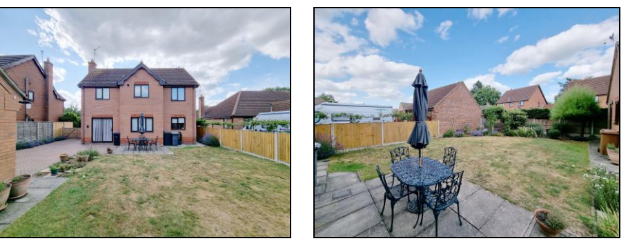
Further Garden Aspect