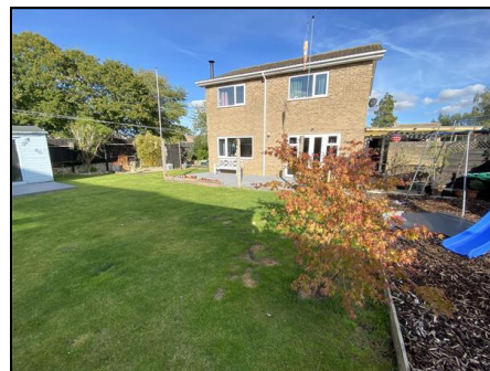
Further Garden Aspect