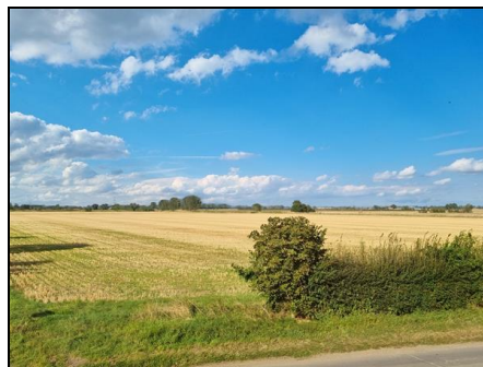
View To Front