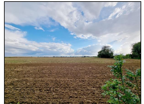
View To Rear