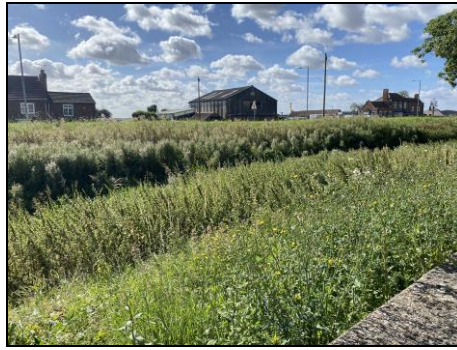
View Towards River