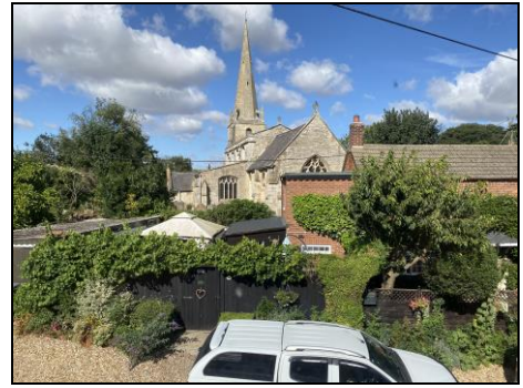
View Towards Church

GROUND FLOOR 1978 sq.ft. (183.8 sq.m.) approx.