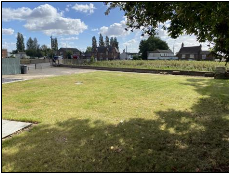
Further Garden Aspect