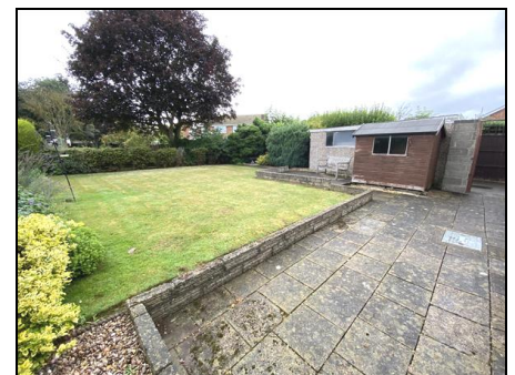
Further Garden Aspect

Agent's Note: These particulars are set out for the guidance of proposed purchasers and act as a general guideline and do not constitute part of an offer or contract. Measurements shown are approximate and are to be used as a guide only and should not be relied upon when ordering carpets etc. We have not tested the equipment or central heating system if mentioned in these particulars and prospective purchasers are to satisfy themselves as to their order. All descriptions, references to condition or permissions are given in good faith and are believed to be correct, however, any prospective purchasers should not rely on them as statements or representations of fact and purchasers should satisfy themselves by inspection or otherwise as to the authority to give any warranty or representation whatsoever in respect of this property. No responsibility can be accepted for any expenses incurred by intending purchasers in inspecting properties that have been sold or withdrawn.