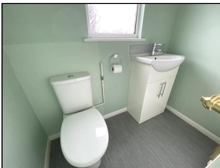
First Floor Cloakroom