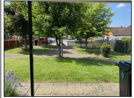
View To Front

TOTAL FLOOR AREA: 553 sq.ft. (51.4 sq.m.) approx. While every attempt has been made to ensure the accuracy of the floorplan contained herein, measurements of doors, windows, rooms and any other items are approximate and no responsibility is taken for any error, omission or mis-statement. This plan is for illustrative purposes only and should be used as such by any prospective purchaser. The services, systems and appliances shown have not been tested and no guarantee as to their operability or efficiency can be given. Made with Metropix 03/24