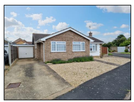
Further Front Aspect