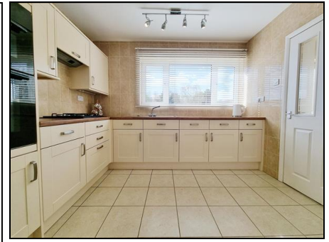
Further Kitchen Aspect

TOTAL FLOOR AREA: 1511 sq.ft. (140.4 sq.m.) approx. Whilst every attempt has been made to ensure the accuracy of the floorplan contained here, measurements of doors, windows, rooms and any other items are approximate and no responsibility is taken for any error, omission or mis-statement. This plan is for illustrative purposes only and should be used as such by any prospective purchaser. The services, systems and appliances shown have not been tested and no guarantee as to their operability or efficiency can be given. Made with Metropix ©2024