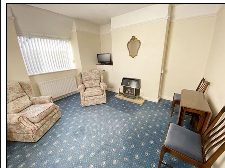
Dining Room/Bedroom 3