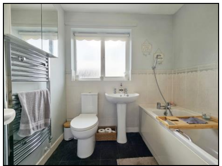
Bedroom 3 Bedroom 4 Bathroom