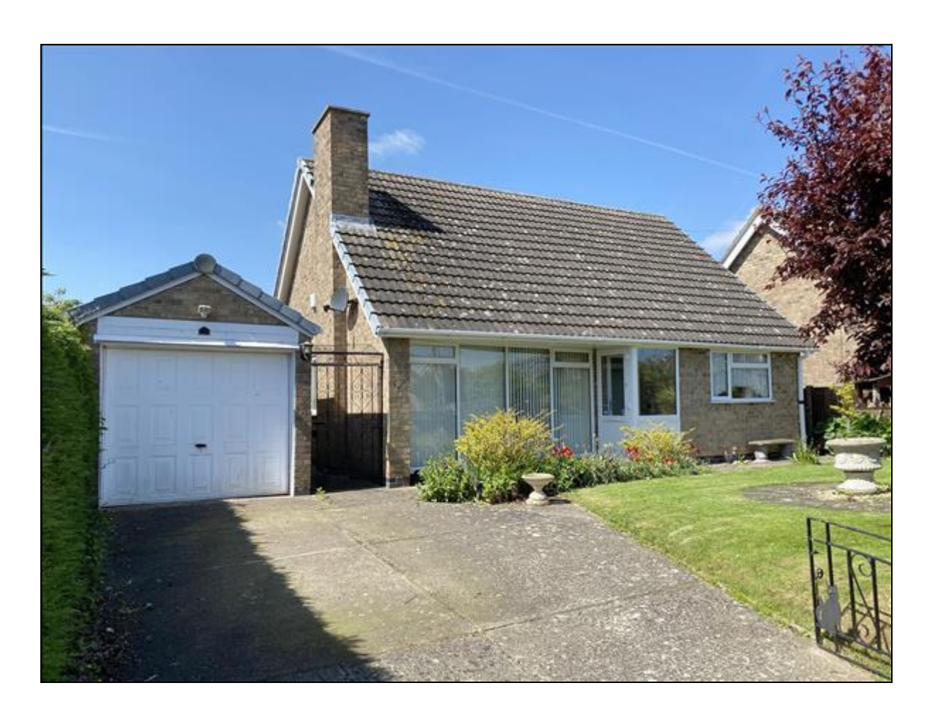
New Price £259,000

With the advantage of No Chain and located within this small cul-de-sac setting enjoying views to the rear over countryside, an extended and much improved Two Bedroom Detached Bungalow with 29' Tandem Garage a well as a further Workshop/Double Garage which could be used as a workshop or for storage. The well presented property benefits from Gas Central Heating and Double Glazing to accommodation comprising Entrance Porch, Hall, Lounge, Extended Dining Kitchen, Two Double Bedrooms, Dressing Room, Conservatory and Refitted Bathroom. There is Ample Parking to the front and the rear garden is fully enclosed and particularly private. Early viewing is advised to appreciate the location of this property and the storage available.