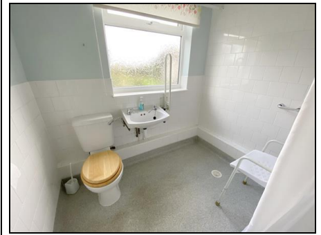
Wet Room Shower Room

TOTAL FLOOR AREA: 812 sq.ft. (75.4 sq.m.) approx. Whilst every attempt has been made to ensure the accuracy of the floorplan contained here, measurements of doors, windows, rooms and any other items are approximate and no responsibility is taken for any error, omission or mis-statement. This plan is for illustrative purposes only and should be used as such by any prospective purchaser. The services, systems and appliances shown have not been tested and no guarantee, as to their operability or efficiency can be given. Made with Metropix ©2022