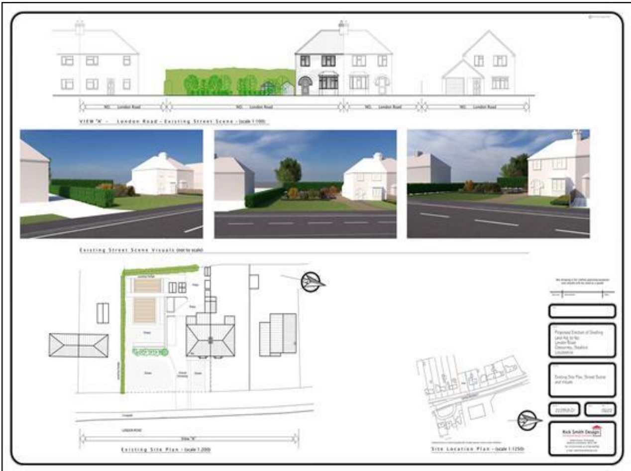
Existing site plan