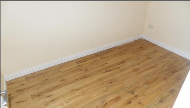
Bedroom 3.61m (11' 10") x 2.28m (7' 6")