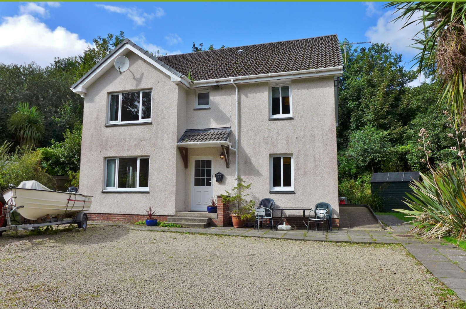
Waterstone House, Whiting Bay, KA27 8QN