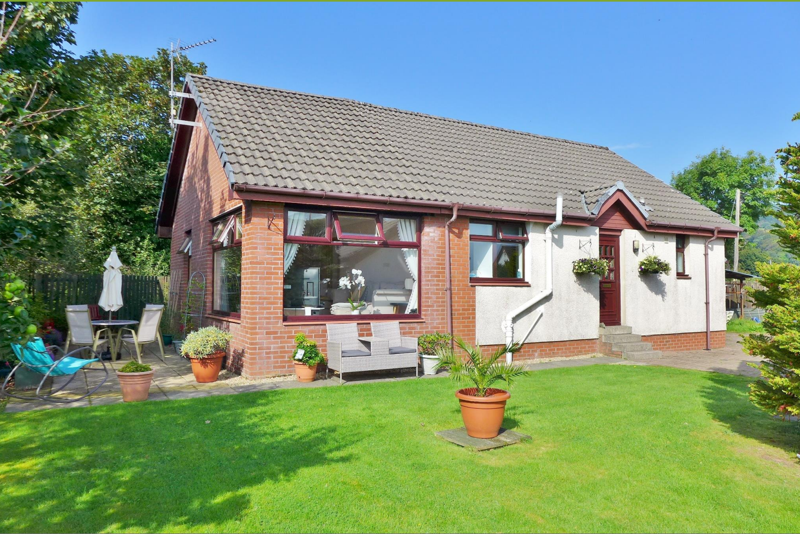
————— Riverside Cottage & Chalet, Lamlash, Isle of Arran KA27 8LS —————