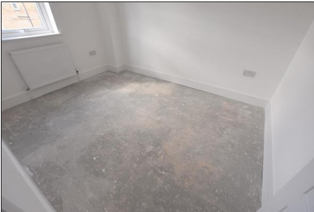
Bedroom Two 2.53m (8' 4") x 3.12m (10' 3")

This is a light filled room with UPVC double glazed to the rear of the property along with a gas central heating radiator.