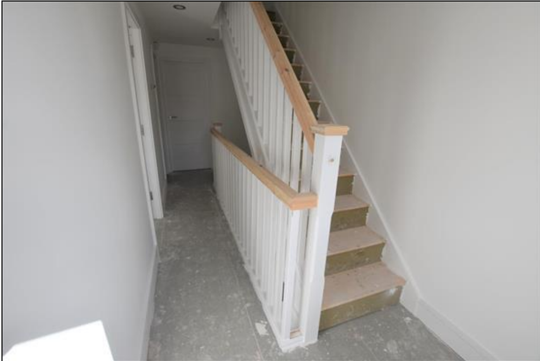
Stairs to the Second Floor