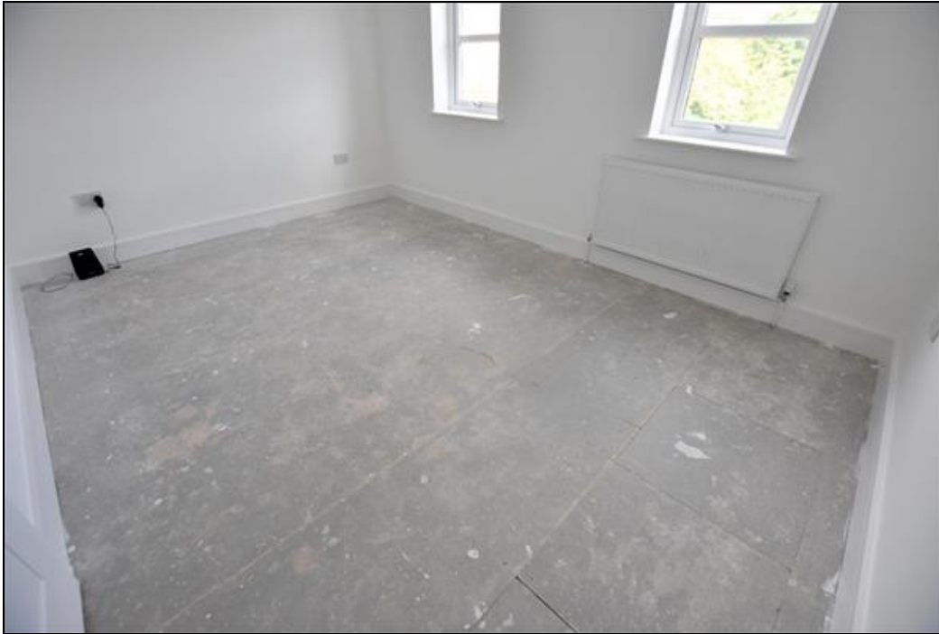
Bedroom One 4.37m (14' 4") x 3.19m (10' 6")

This is a light filled room with UPVC double glazed to the rear of the property along with a gas central heating radiator.