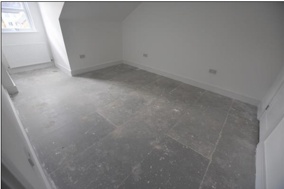
Master Bedroom 3.31m (10' 10") x 4.12m (13' 6")

This large master bedroom is situated on the third floor and has a UPVC window to the front of the house. There is a television aerial point and a central heating radiator. There is a door into the ensuite shower room and walk in closet.